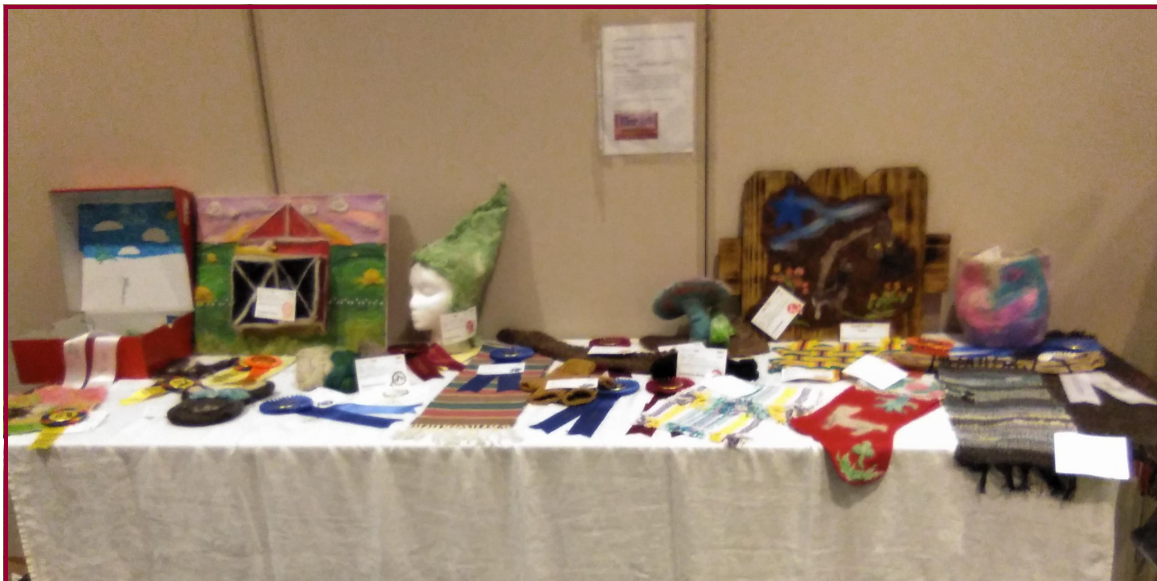
2022 Florida State Fair Fiber Show Entries